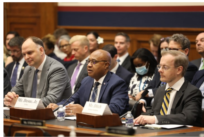
U.S. House Committee on Transportation & Infrastructure